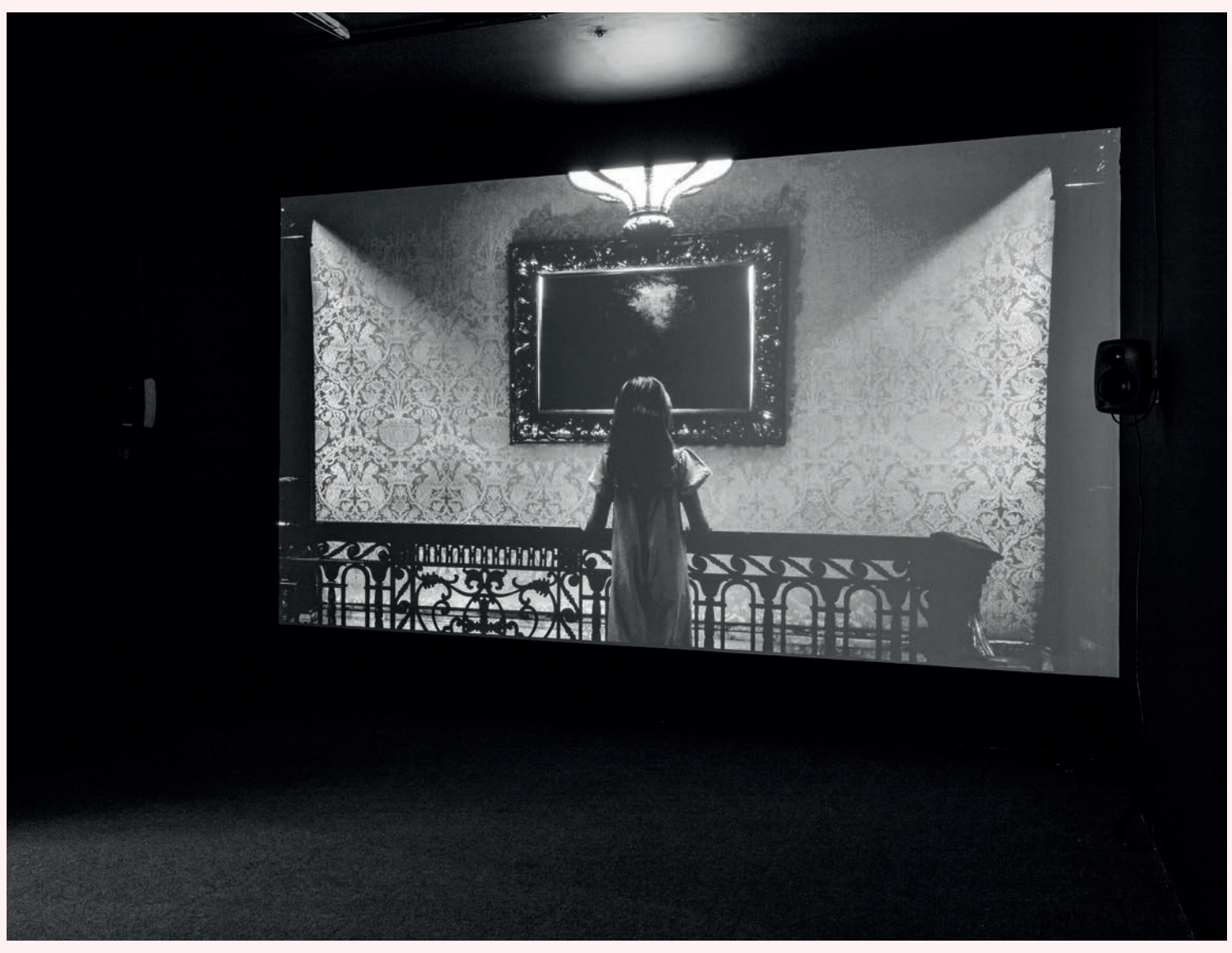
Claire Savoie, Sans titre, 2019. Exhibition view at Château Dufresne.