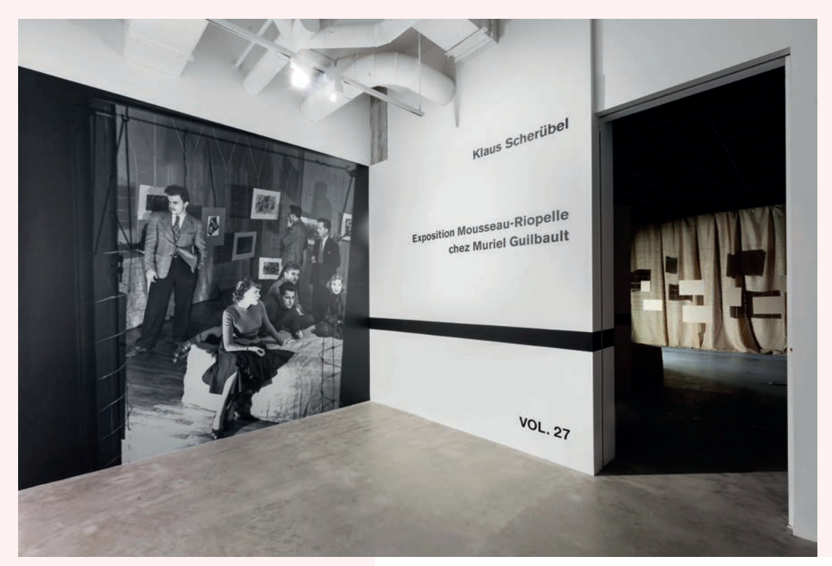
Klaus Scherübel, Sans titre, (Exposition Mousseau-Riopelle chez Muriel Guilbault, 1947), 2019. Exhibition view at VOX, centre de l'image contemporaine.

political stances, his thoughts and ideals during the complex historic period of Canadian Confederation. Art historian Peter Geimer has put into words what Robert made audible in his disruptive work on site. According to Geimer, historic sites are usually staged as places where important pictures were painted, texts were written or thoughts were born. The incantation of those interiors is: important things have happened here and one can trace them.<sup>2</sup> The idea that something of the works, actions and thoughts—respectively the "genius"—of the former inhabitants is sedimented in the rooms and the furniture, is exclusively a matter of the imagination. The entire scenography of these sites is based on the idea of being close to historical personalities and to be able to "activate" something long gone. Curatorial practices related to this scenography—as mentioned above—often reach theatrical dimensions: Geimer writes that the "emptiness" at these sites is obscured with "garlands of flowers and pictures, fireplaces, display boards and quotations of quotations." In this reading, Cartier's house today is to be viewed as a richly decorated fragment.