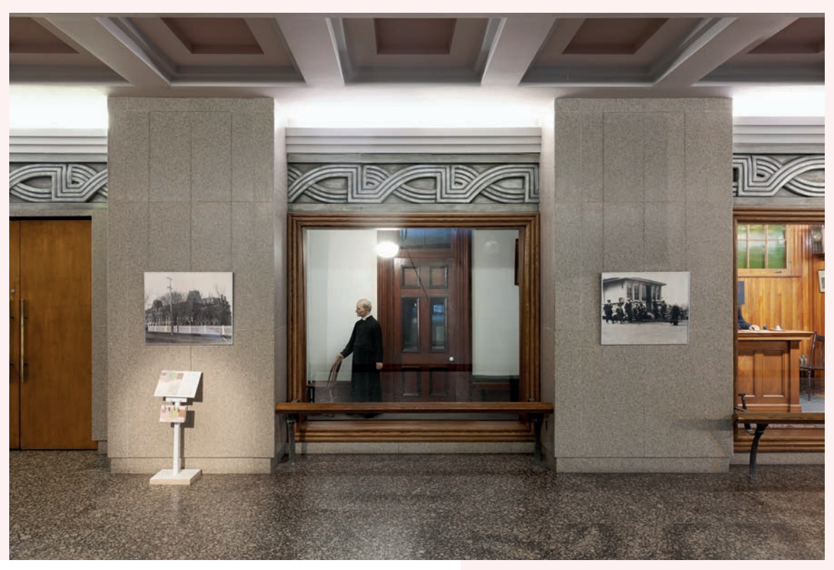
Steve Bates , The Voice Moves the Air , 2019. Exhibition view at Saint Joseph's Oratory.